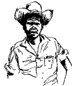
LES CALLOPE 1969