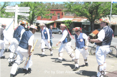
Morris Dancers in the street at Maldon Folk Festival

HURRY! - ENTRIES FOR BOTH CLOSE 31ST DECEMBER