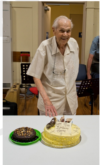
Photographs by Trevor Voake—not part of the memorial service booklet